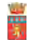
Comune di Massa Marittima